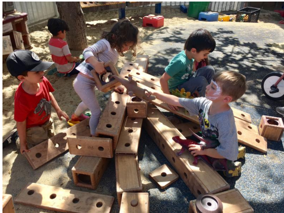
Children playing on Messy/Water Day.