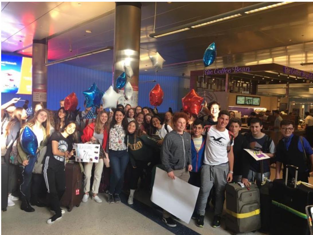
Israeli Twins Have Arrived!