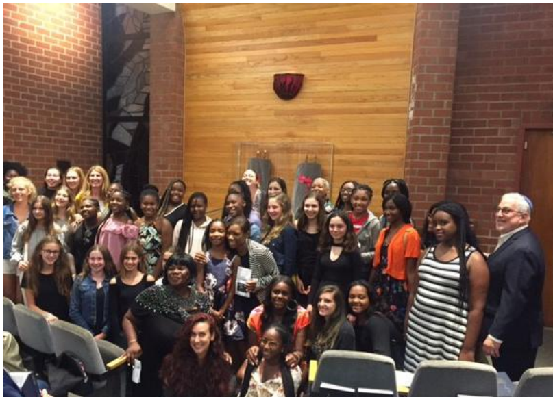
Welcoming Girl Talk Philly at Shabbat Services -----