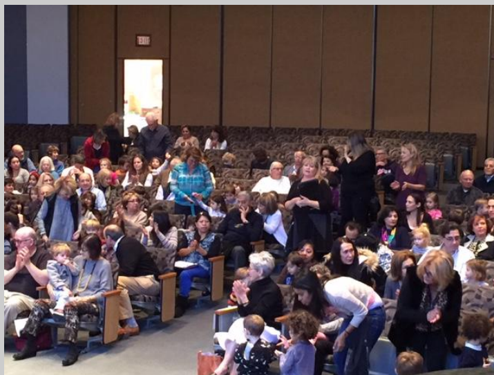
Grandparents' Day at ECLC