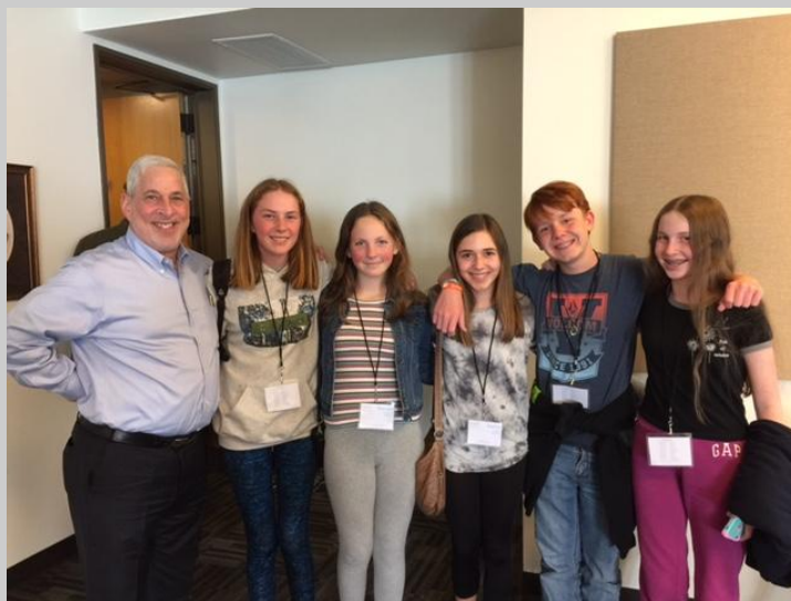
NFTY Jr Event